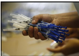
"A health worker holds doses of influenza A (H1N1) vaccines in a jail in Ciudad Juarez March 29, 2011". "Deal near on flu virus-sharing, vaccines". Nebehay, Stephanie. AlertNet Apr 12 2011.